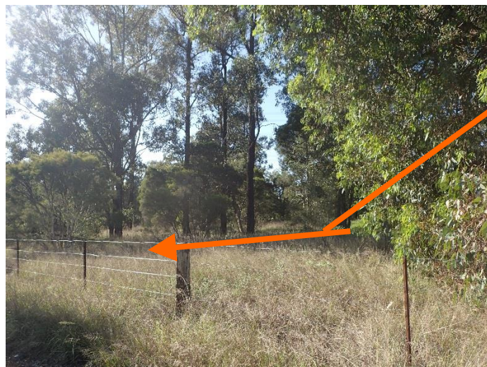
Photograph 03: View east from Park Road toward Vineyard Park