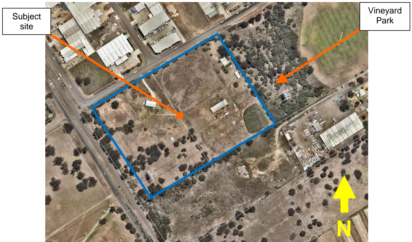
Image 02: Aerial view of the subject area December 2016