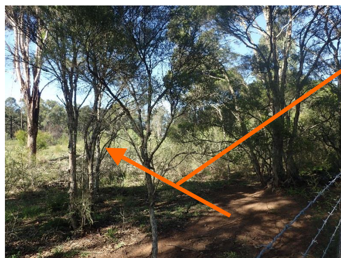
Photograph 04: View south from within the subject property (adjacent to Lot 215)