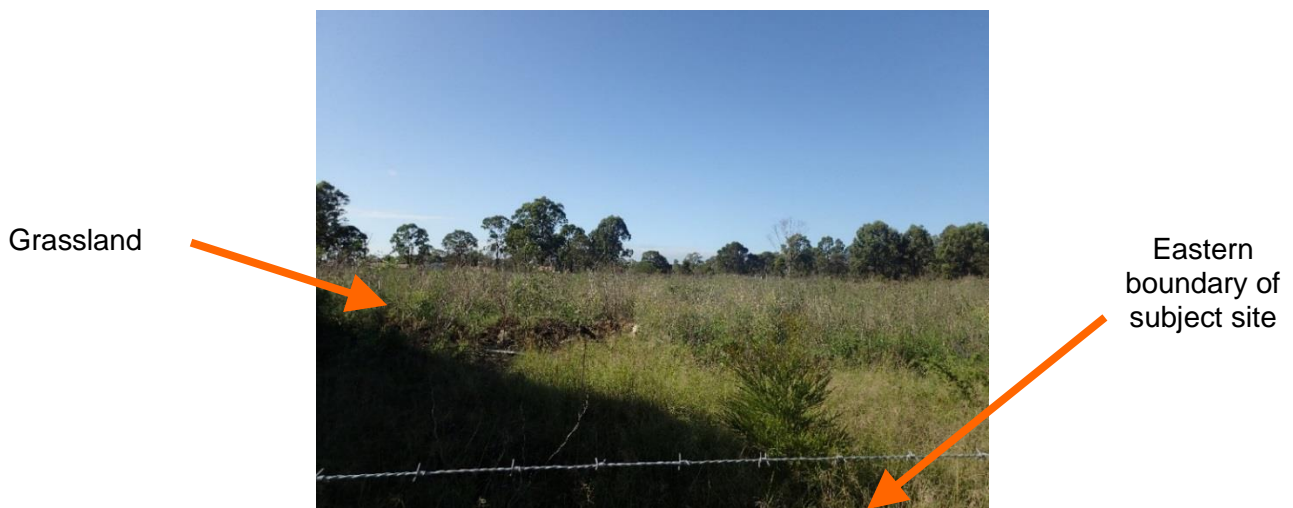
Photograph 02: View east from within the subject site