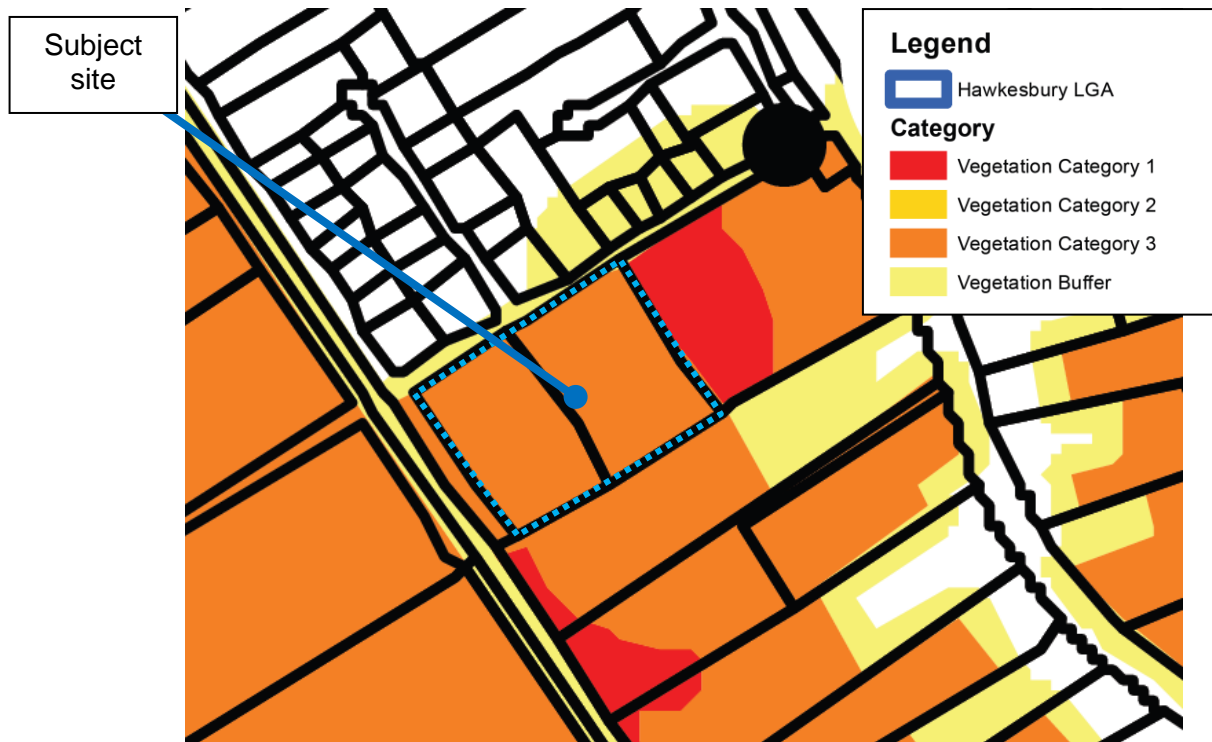
Image 01: Extract from Hawkesbury Council's Bushfire Prone Land Map

To determine the suitability of the subject planning proposal and the ability of the site to accommodate the relevant Bushfire Protection Measures for both commercial / industrial and SFPP development at future development application a bushfire threat assessment has been undertaken. The inputs and conclusion of this assessment is detailed below: